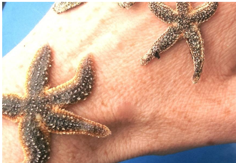
Star fish found on the shore near Killala

Killala is a rural town within a largely agricultural landscape. Much of our wildlife is found on farmland in the quiet corners of fields, hedgerows, scrub, woods and wetlands. Lough Meelick is a small lake south-east of the town with a wetland fringe. It is significant for its population of Thin-lipped Mullet, which is rare in Irish waters.