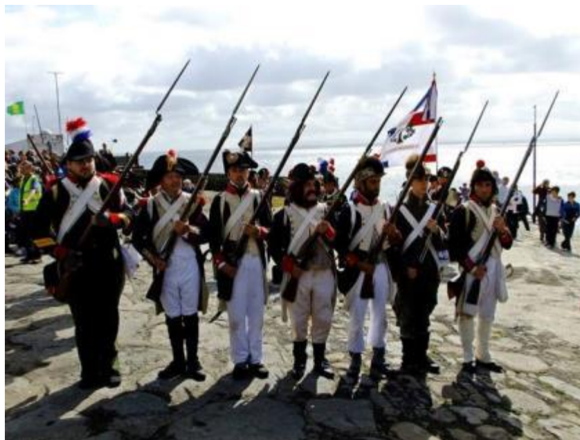
Re-enactment of 1798 French landing in Killala as part of The Gathering in 2013

There is a vibrant community in Killala as evidenced by the huge number of community groups active in the area. Many are working to improve local amenities and the local environment. The 'Killala Nature and Wildlife Plan 2014-2017' is an opportunity to learn more about the rich natural heritage in the area, to protect and enhance this wonderful resource for the benefit of nature and wildlife, visitors to the area and the local community.