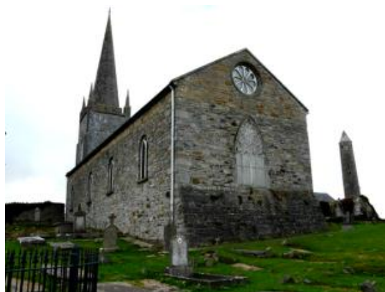
St Patrick's Cathedral with Killala Round Tower in the background

Killala and environs also has a rich ecclesiastical heritage including the prominent round tower in the town, Moyne Abbey, Rosserk Abbey, Rathfran Abbey, the Church of Ireland Cathedral, Meelick Castle, old graveyards, old bridges and the old railway line. Wildlife can be found in these old structures, birds and bats, mosses, ferns and lichens.