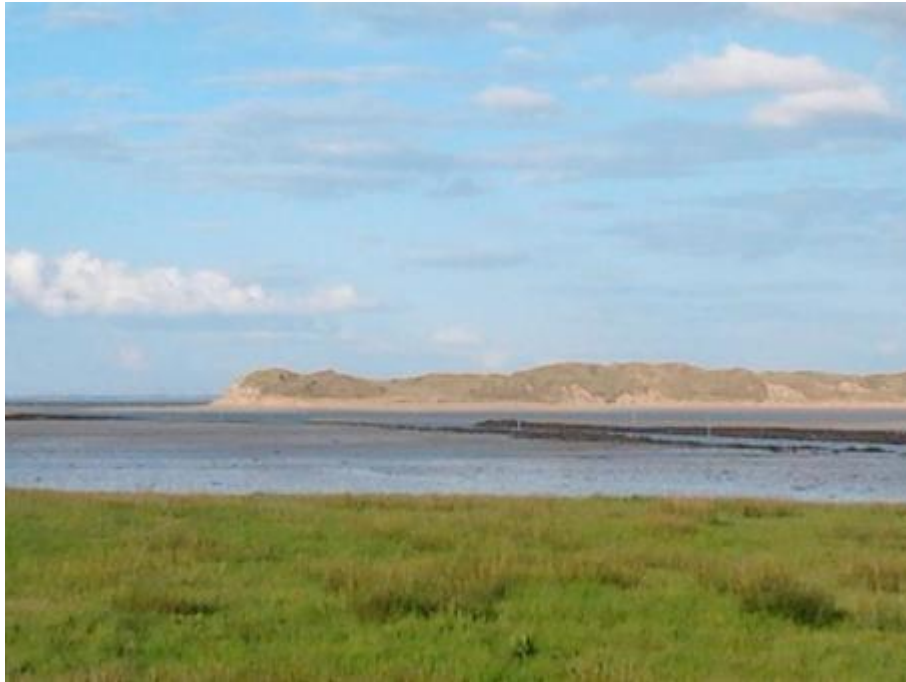
View of dune system on Bartragh Island

Out in Killala Bay, Seals, Dolphins and Porpoises can often be seen. The dune system on Bartragh Island is considered one of the best in the county because of the lack of disturbance. There are also sand dunes at Ross beach.