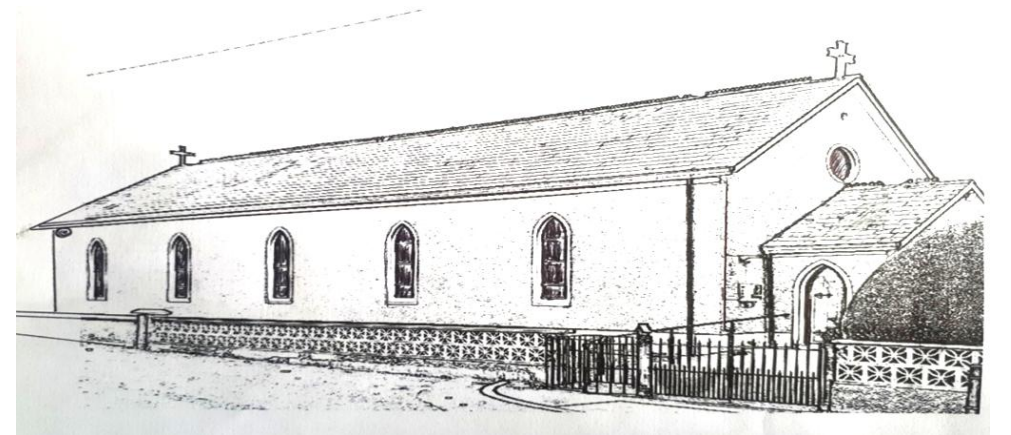
Holy Rosary Church, Glenisland