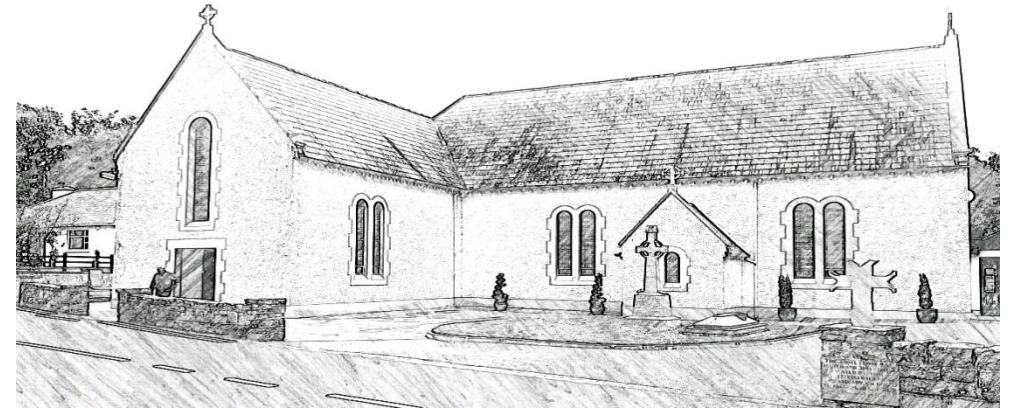
St. Patrick's Church, Islandeady

Sunday 17 th Jan 2021 – Second Sunday in Ordinary Time