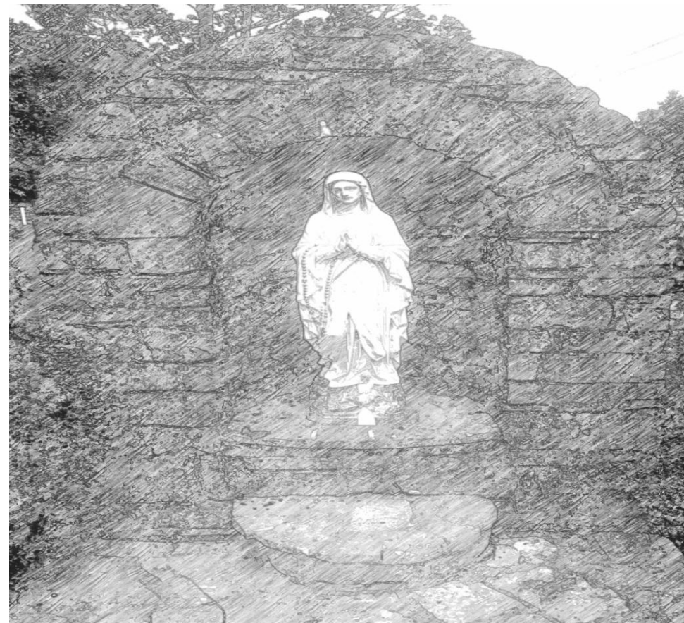
Our Lady's Grotto at Islandeady Church

Sunday 16 th August 2020 – 20 th Sunday in Ordinary Time