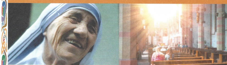
Happy are those who have not seen and yet believe

The Lord be with you. And with your spirit. May the blessing of almighty God, the Father, and the Son, ✠ and the Holy Spirit, come down on you and remain with you for ever. Amen. Go in peace, alleluia, alleluia. Thanks be to God, alleluia, alleluia.