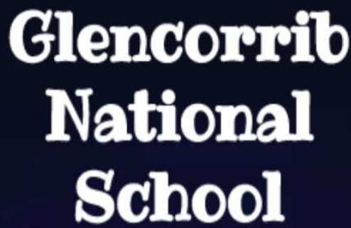
TABLE QUIZ NIGHT