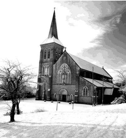
St. Patrick's Church, Ballyhaunis