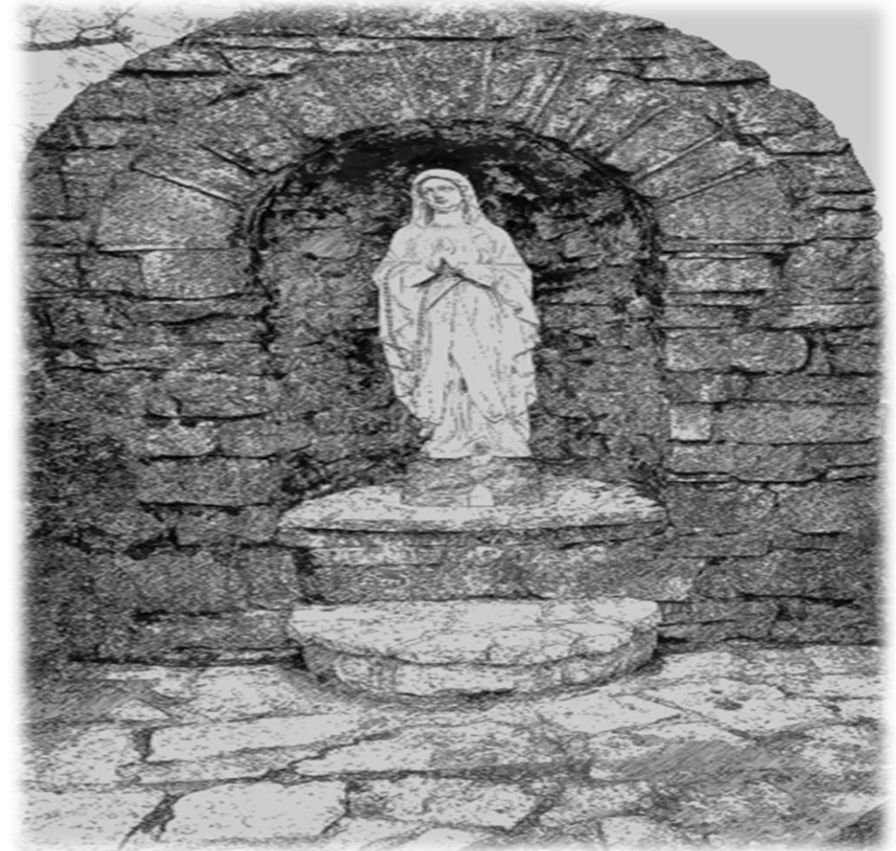
Grotto to the Virgin Mary, St. Patrick's Church, Islandeady

Sunday 09 th May 2021 – 6 th Sun of Easter