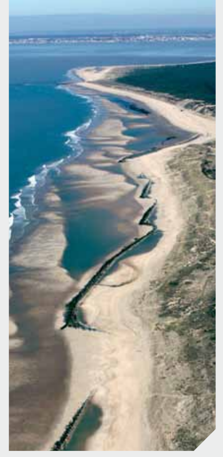
Soulac, Aquitaine (France)