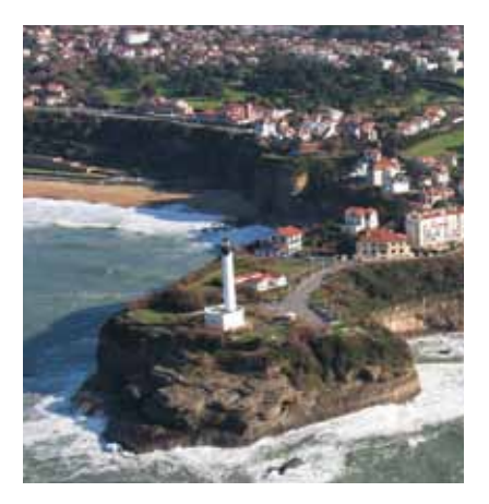
Rocky coast (France)

Leisure and massive tourism activities, together with the creation of new infrastructures, urbanization by the shoreline, artificial infrastructures.