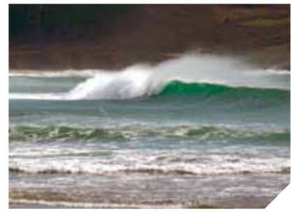
Nemiña, Muxía, Galicia (Spain)

The main causes of floods are heavy storms. The action of storms causes a rise of sea level above normal tide level. This process, joined to the swell strength, can cause an extreme overtopping, causing the overflowing of dune chains and other coastal defences, especially when the storms occur at the same time as spring high tides.