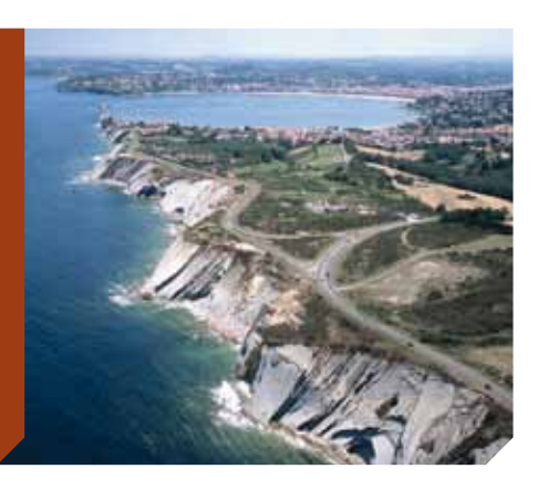
Saint Jean de Luz, Aquitaine (France)

and water and atmospheric temperature rises. These phenomena could also cause indirect changes in currents, water composition, erosion, wind and storm strength and frequency. Climate change is thus likely to have an impact on many coastal risks.