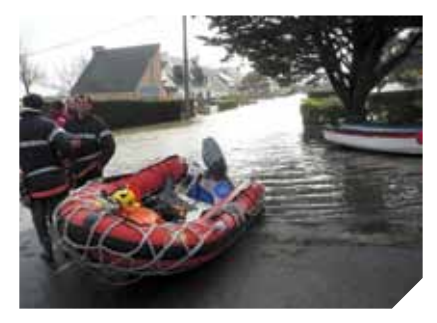
Gâvres area (France) (storm from year 2008)