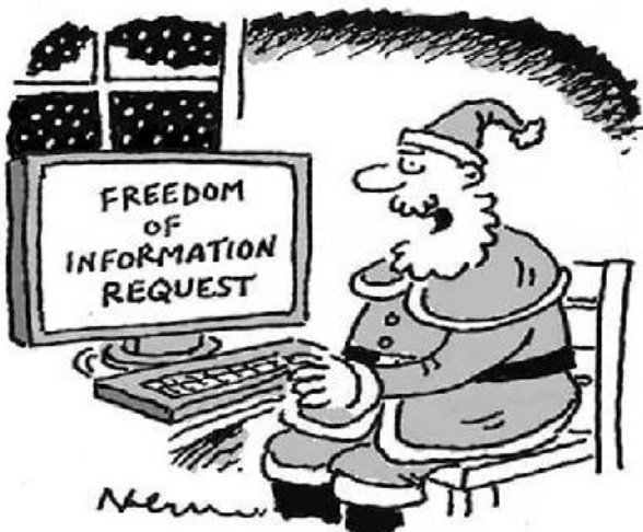
'So who's been naughty and nice?'

REMEMBERING OUR BABIES AT CHRISTMAS: Our annual Mass remembering all babies who have died on or around the time of birth (stillbirth, neonatal, miscarriage} will be held on Sunday 19 th December 2021 at 6pm at The Church of the Immaculate Conception, Oranmore. Parents, Grandparents, Siblings, family and friends are all warmly invited to this special Mass. The Mass will follow Covid protocols and will also be live streamed on http://www.oranmoreparish.org/live .