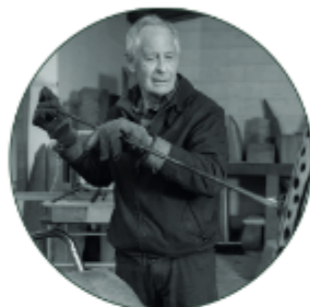
David Nash OBE, RA Sculptor