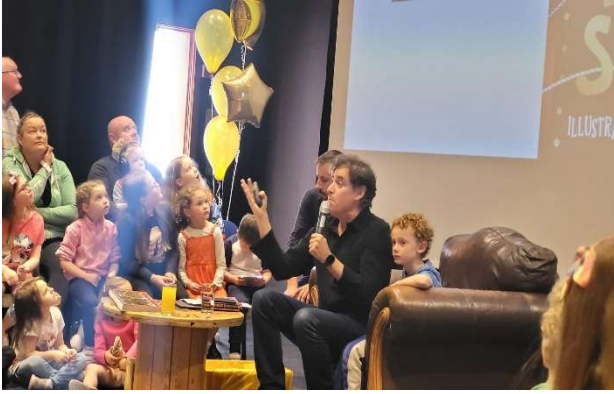
Actor & author Stephen Mangan, Belmullet Library