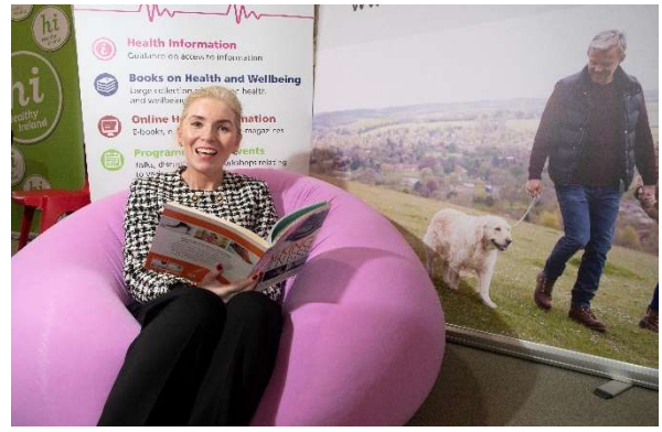
Launch of CROI Health Fair, Castlebar Library