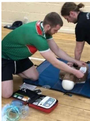
2023 Basic Lifesaving Exams – Lecanvey Community Centre