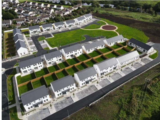
Rehins Fort, Ballina Completed September 2023

Mayo County Councils Architects Department , encompasses a large range of in-house technical expertise incorporating Architects, Engineers, Architectural Technicians, Clerks of Works, Surveyors, Horticulturalists and Clerical Staff, located throughout the County.