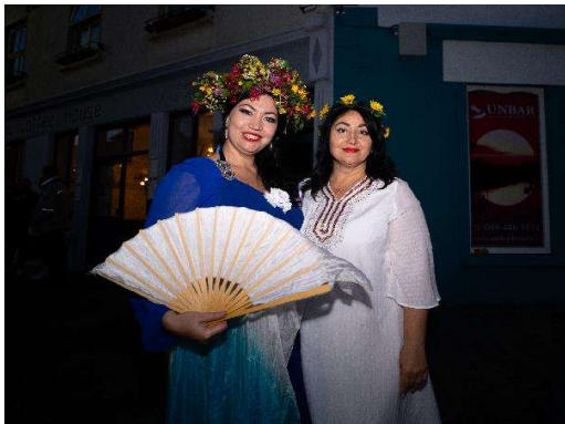
Culture Night 2023 – ‘Where is Home’ Culture Night Late Claremorris