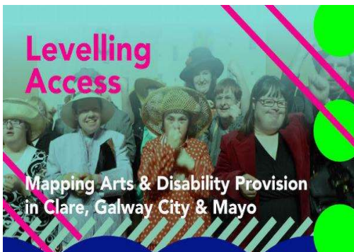
Levelling Access – Mapping Arts & Disability Provision in Clare, Galway City & Mayo