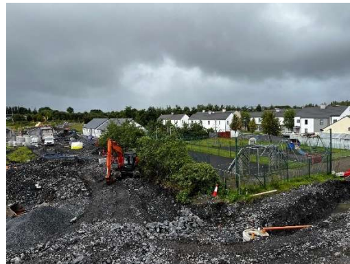
22 Units at Lios Na Circe, Castlebar.