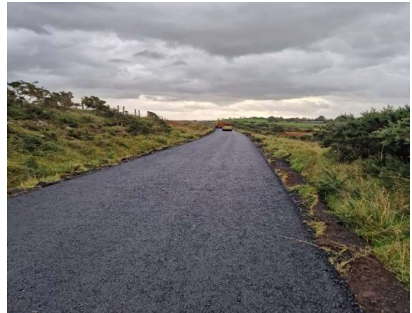
Surface renewal works on the Greenway