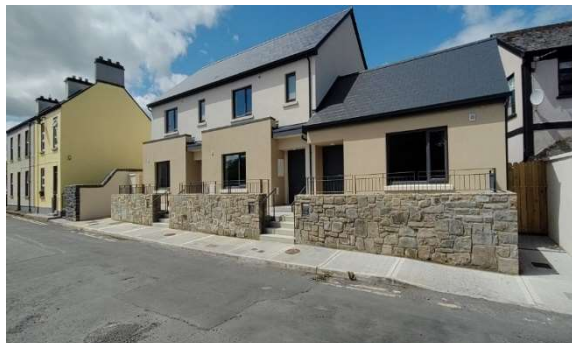
Units completed at The Boreen, Crossmolina