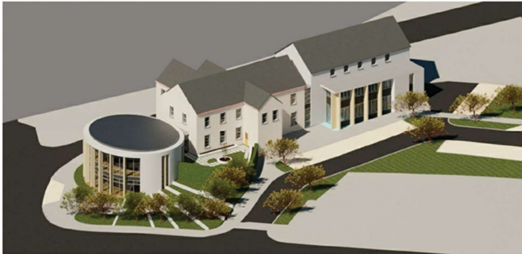
Proposed Westport Library & Civic Offices

In the Municipal Districts the Architectural teams are progressing the Castlebar Historic Core Reactivation and Regeneration Initiative, new parks in Partry & Balla, the Ballyhaunis Library and Ballinrobe Cemetery. Also, the Newport & Belmullet Regeneration projects and Killala Town Centre First plan. 2023 will also see the completion of the much-anticipated Ballina Innovation Quarter within the towns historic Military Barracks.