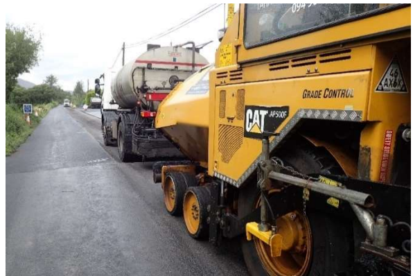
N59 Liscarney 2023