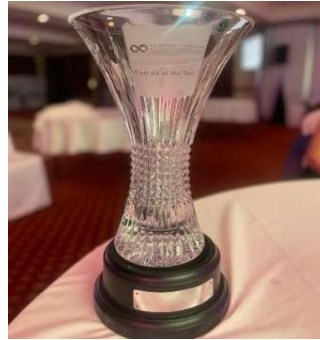
Figure 5 'Council of the Year' Award - LAMA Awards

Awards: In April Mayo County Council won the prestigious 'Council of the Year' Award at the LAMA (Local Authorities Members Association), the council was also shortlisted in a number of categories including 'Best Green Sustainable Initiative, Best Community Transport Initiative, Best Trail in Ireland, Best Tourism Initiative. In November Mayo County Council claimed two awards at the Chambers Ireland Excellence in Local Government Awards . Mayo County Council were named as winners in the Climate Change Award category and the Supporting Tourism Award category.