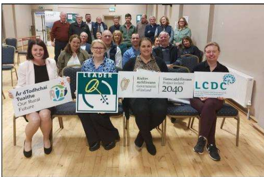
LEADER 2023 – 2027 public consultations