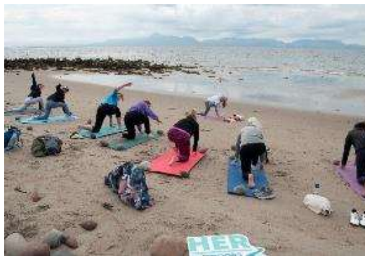
Launch of HER Outdoors Week which took place in August 2023