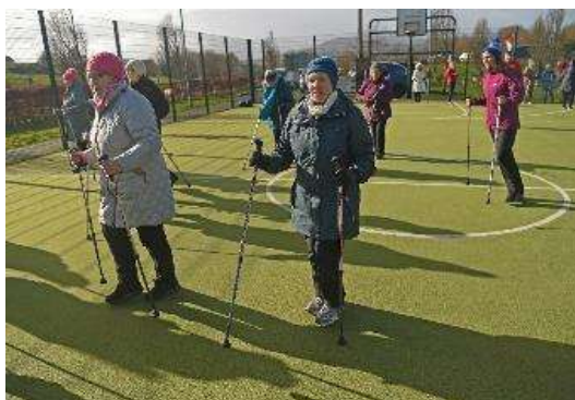
Participants on the Activator Walking with Poles Programme going from strength to Strength.