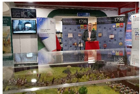
Launch of Year of the French programme in Castlebar Library