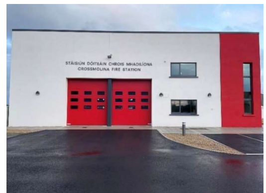
New Fire Station at Crossmolina

Capital grant aid was also received from the Department for the provision of a new Class B Fire Appliance and 2 number 4WD vehicles, all of which have been fully commissioned. They went on the run during 2023.