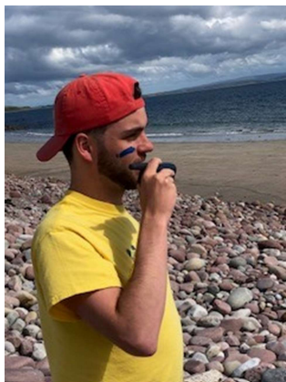
Lifeguards on duty at Mulranny

World Drowning Prevention Day on 25 th July, 2023 was marked by our Lifeguards by wearing blue face paint to remember the victims of drowning around the world.