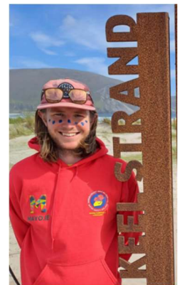
Lifeguard at Keel Strand

Mayo County Council provides ringbuoys at 558 locations in Co. Mayo and these are constantly inspected and monitored by Council staff in all Municipal Districts. The extreme weather conditions along the Atlantic coast occasionally results in coastal erosion and creates the necessity to replace ringbuoys and safety information signage, when necessary, at certain locations.