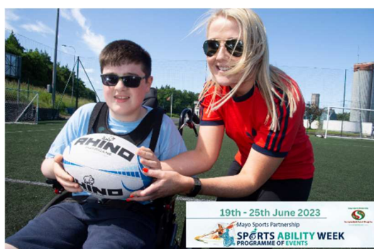
Sports Ability Week June 2023