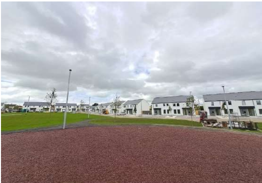
50 Unit Social Housing Scheme at Rehins Fort Ballina