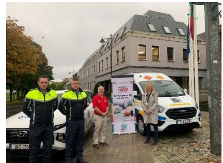
Figure 4 Road Safety week 2023