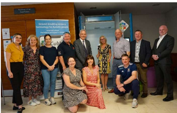
Launch of Sensory Cubbie in Belmullet Library