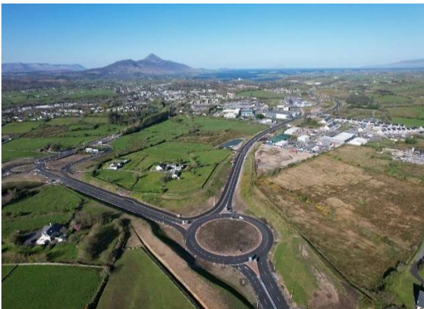
N17-R320 Lisduff N5 Westport to Turlough