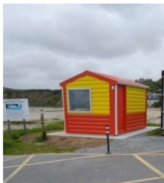
New hut on-site at Carrowniskey Beach

World Drowning Prevention Day on 25 th July, 2023 was marked by our Lifeguards by wearing blue face paint to remember the victims of drowning around the world.