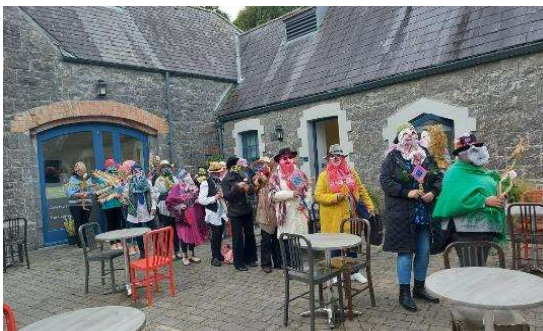
Mayo's Older Persons Council Creative Ireland Project, filmed at Turlough House – "Celebrating the spirit of St. Brigid"