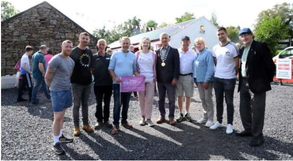
Celebrating Heritage Week 2023

implement actions in their Local Biodiversity Plans . Contributing to the collection of information and understanding of our heritage, further surveys of Mayo's heritage assets will be undertaken. We will continue to advise, support and work with communities to preserve and enhance their natural, cultural and built heritage, while promoting traditional skills and crafts.