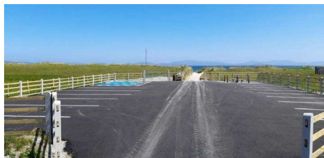
Mullaghroe Blue Flag Beach Trailhead Improvements

Trailhead improvements were carried out at Raheen Wood, Erris Head and Mullaghroe Blue Flag Beach, Funding of €90,000 was made available under the Outdoor Recreation Infrastructure Scheme.