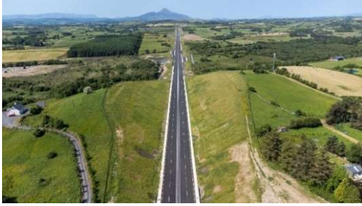
Figure 4 N5 Westport to Turlough