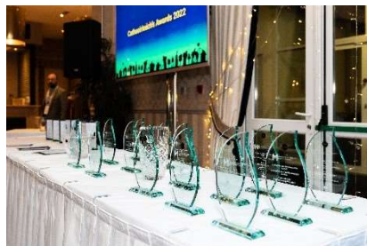
Cathaoirleach's Awards 2023

Mayo Day 2023: Mayo Day returned with the largest Mayo Day flagship event to date! Mayo Day 2023 took place in Ballina, which coincided with Ballina celebrating its 300th Birthday, a year-long celebration of the town, its history and heritage and Mayo Day 2023 saw Ballina transform for a day of celebration with something for all the family.