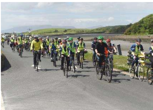
National Bike Week took place in June 2023 with many events taking place across the County.