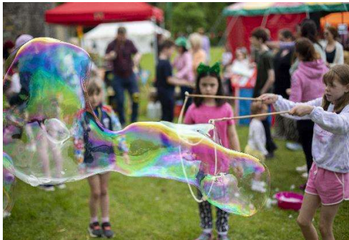
Onsight 2023 – 25 th Anniversary of Mayo Artsquad, celebration of Community and Art