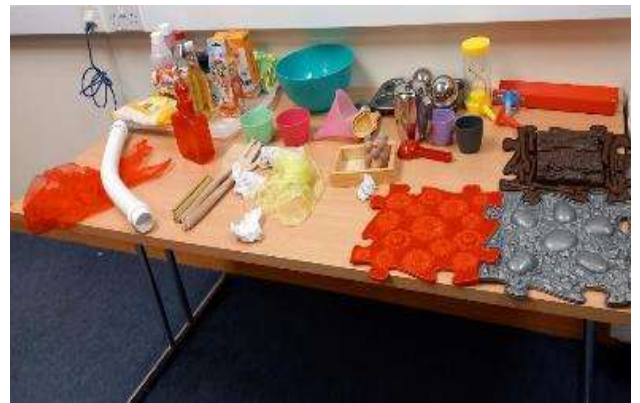
Childminding network on Sensory play in MCCC offices – Aug 2023