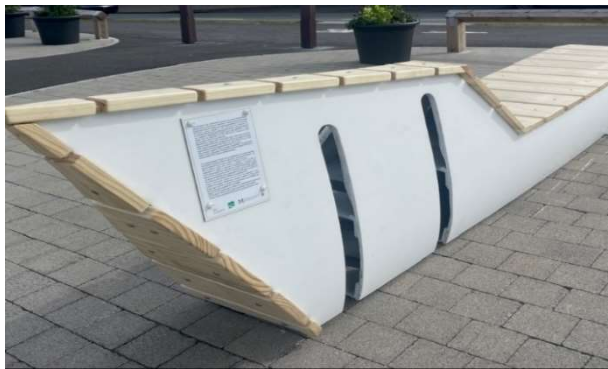
Wind Turbine Trail Furniture

The wind turbine blades furniture is the first street furniture made in Ireland. The end-of-life wind turbine blades which had previously generated power for over 15 years in Ireland that are normally consigned to landfill. By repurposing the blade waste from the wind energy sector, this decouples the generation of renewal energy from the production of waste and promotes sustainability and circular economy.