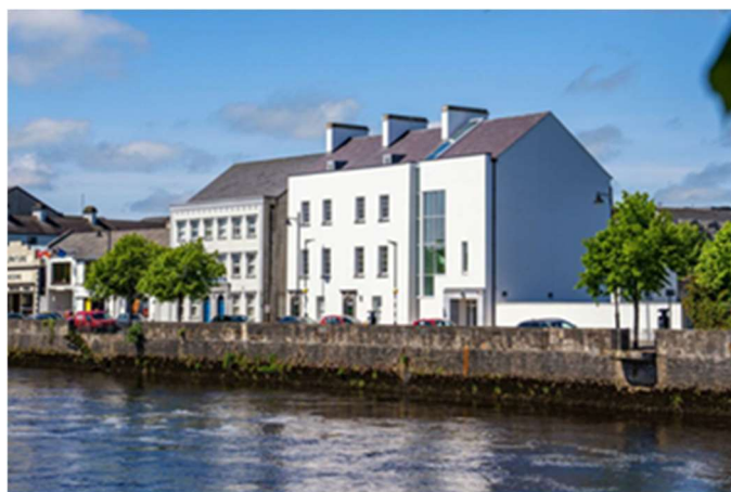
Mary Robinson Centre, Ballina

We will continue our commitment to Rebuilding Ireland in 2024 which will see the commencement of the construction of new housing on sites including Achill Sound (20), Lower Charles St Castlebar (4), Church Manor Ballina (3), Ellison Street Castlebar (12), amongst others. There are also projects planned for Abbeyquarter Ballyhaunis (37), Belmullet (8), and Lawn Road Castlebar (28). We are also working on the following 3 separate sites in Ballina, Cheshire Homes (68), The Meadows (12) and Duffy's Bakery (28) these complimented by a host of smaller sites around the county, varying in size from 1 to 10 units.