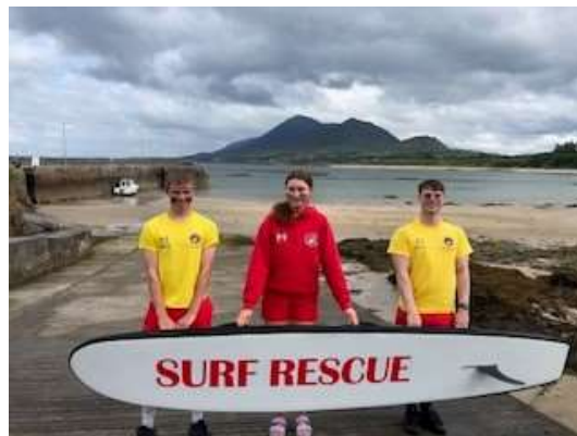
Lifeguards at Old Head Beach