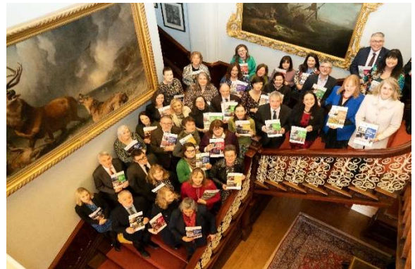
Launch of Creative Ireland strategies in Farmleigh House, Dublin in March