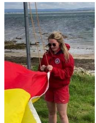
Lifeguard Raising the flag at Ross