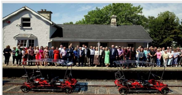
Kiltimagh Velo Rail Opening

On Friday 9 th June 2023, Ireland’s first Velo Rail Project was officially opened by Deputy Michael Ring TD, The Velo Rail is a new sustainable tourist attraction located in Kiltimagh, it is a unique and fun experience for visitors of all ages. The Velo Rail allows users to pedal along a disused railway line. The old disused railway line was repurposed to accommodate this new experience.