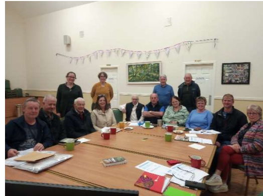
Field Names Recording Workshop Shrule