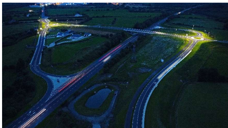
N17 – R320 Lisduff, Claremorris