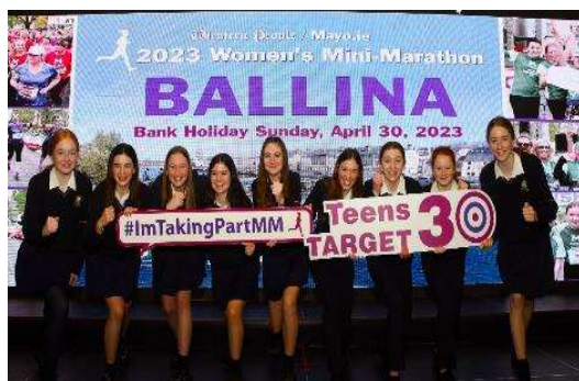
Mayo.ie Western People West of Ireland Women's Mini Marathon Launch 2023 hosted in Ballina for the first time as part of the Ballina 2023 celebrations.