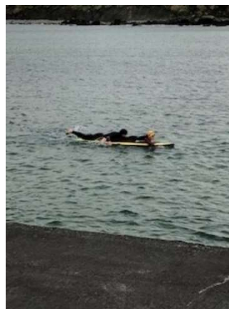
2023 Open Water Fitness Test – Lecanvey Pier