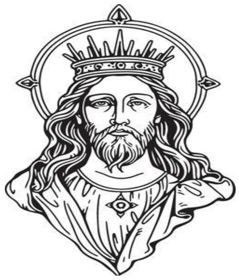
"Yes, I am a King. I was born for this, I came into the world for this; to bear witness to the truth."

Sunday 24<sup>th</sup> Nov 2024 – Christ, King of the Universe