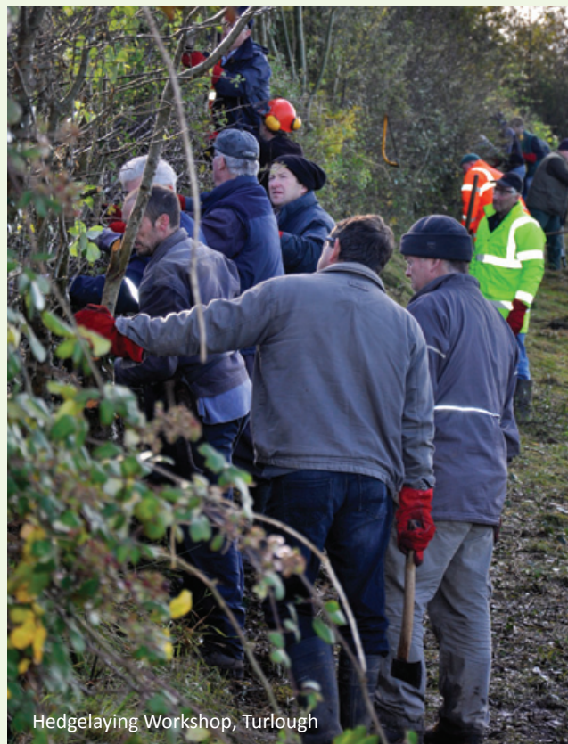
Hedgelaying Workshop, Turlough